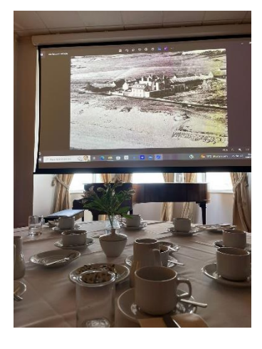
All ready for the Lihou fundraising event at Les Cotils! The afternoon was a great success with an interesting

slide show and talk raising an amazing £430.50